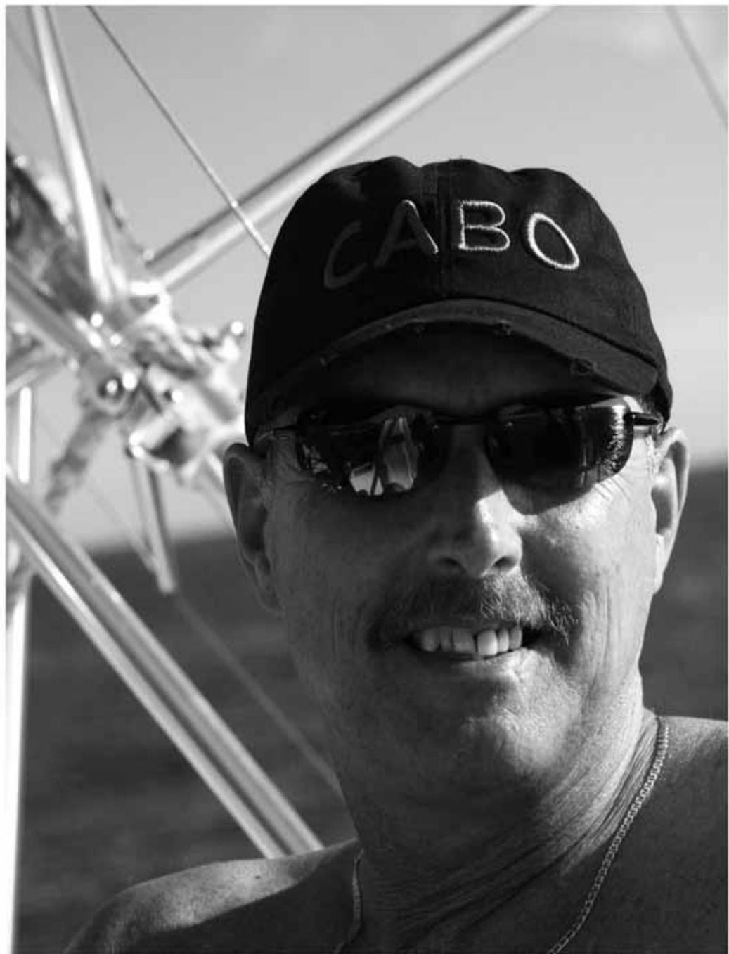
Cabo, Mexico. 2010.