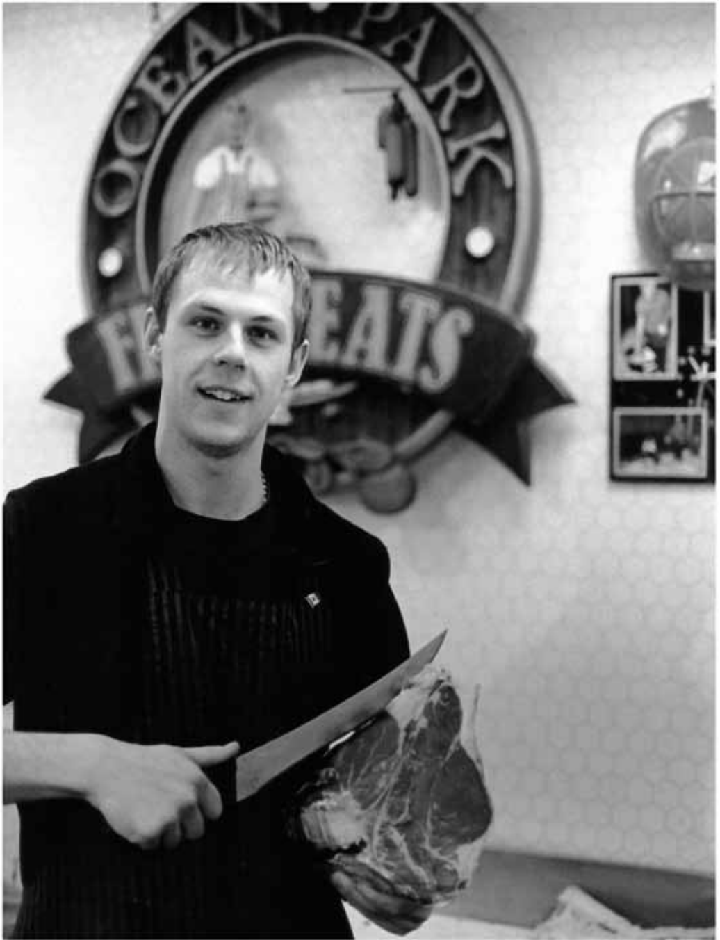
'Ocean Park Meats' Ocean Park, BC. 2010.