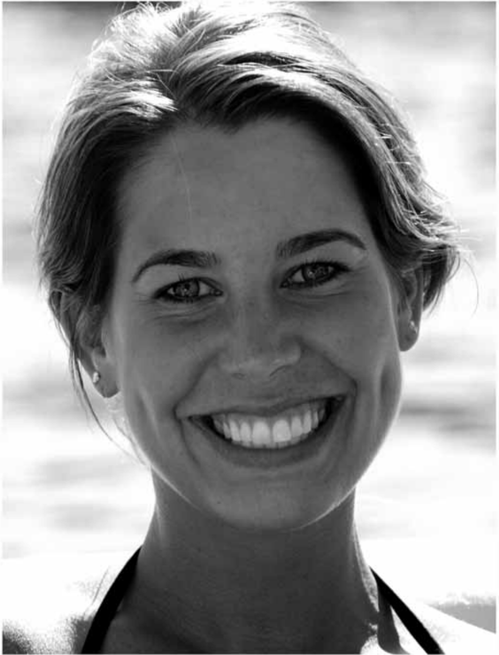
Shuswap, BC. 2009.