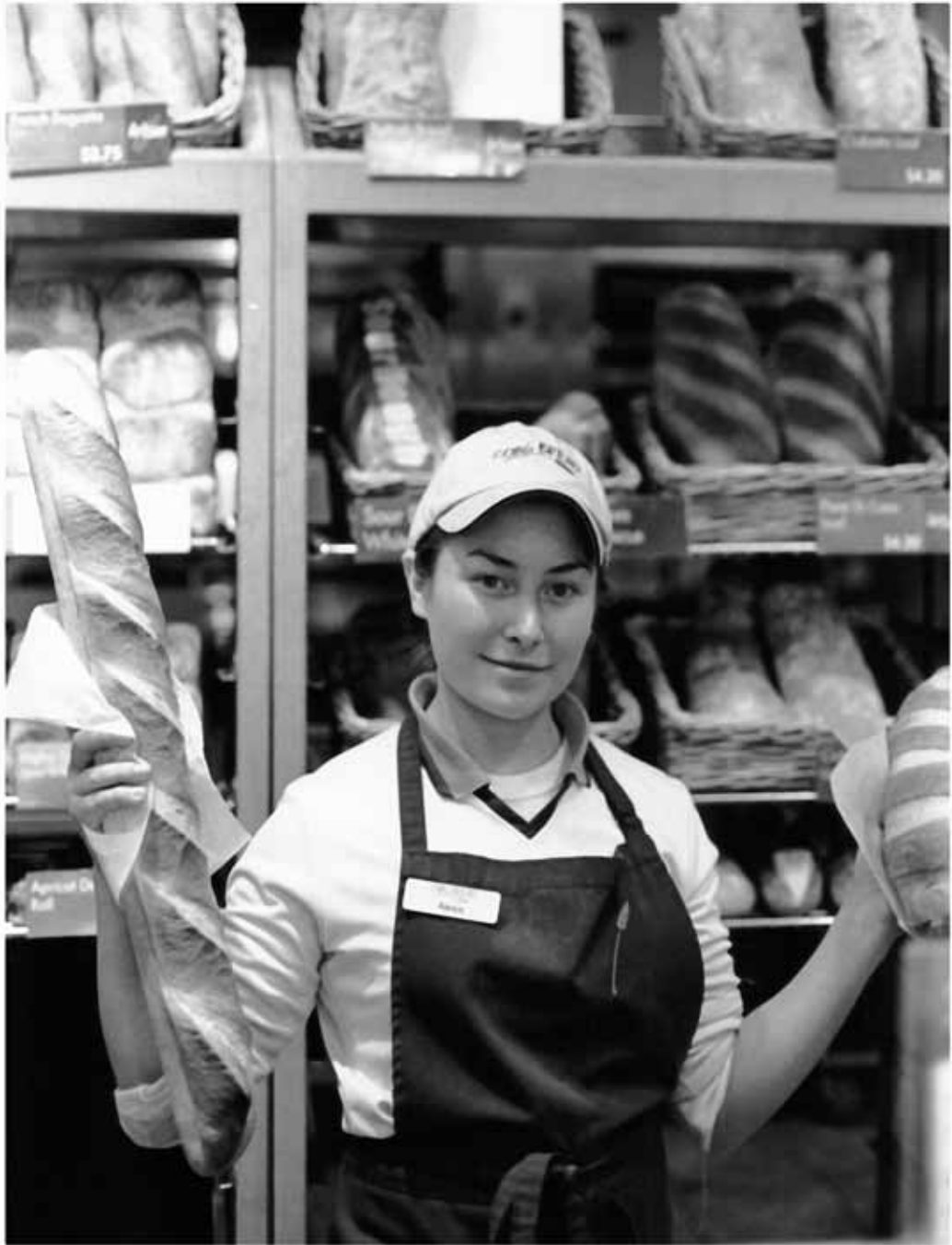
'Cobbs Bakery' Ocean Park, BC. 2010.