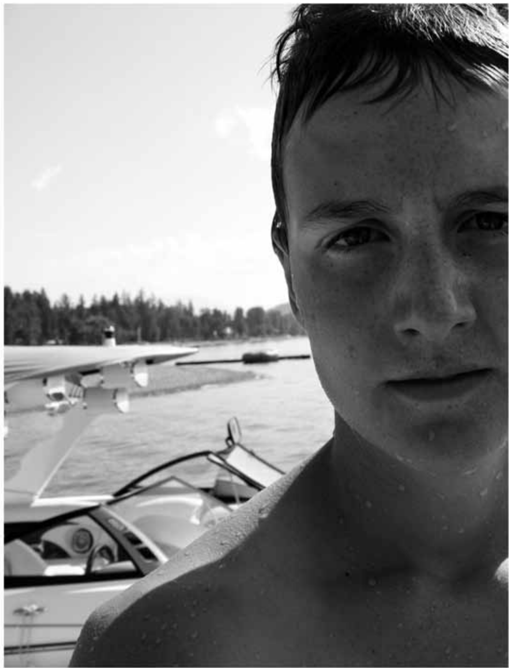
Shuswap, BC. 2009.