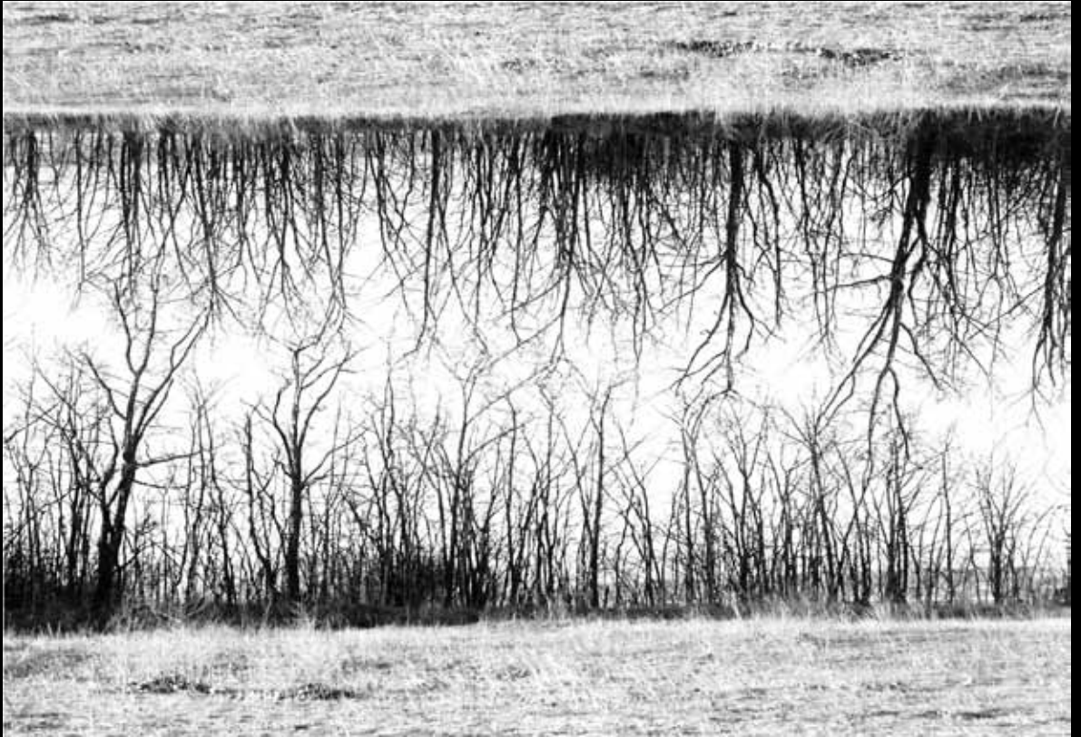
Crescent Beach, BC. 2010.