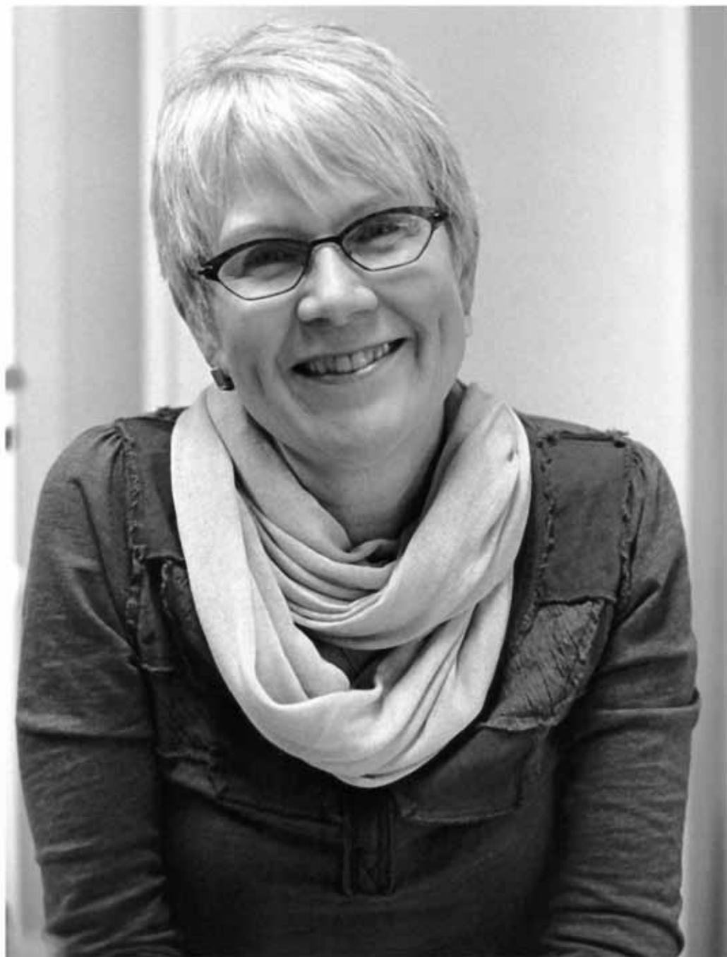
'JJ Whiskey' Ocean Park, BC. 2010.