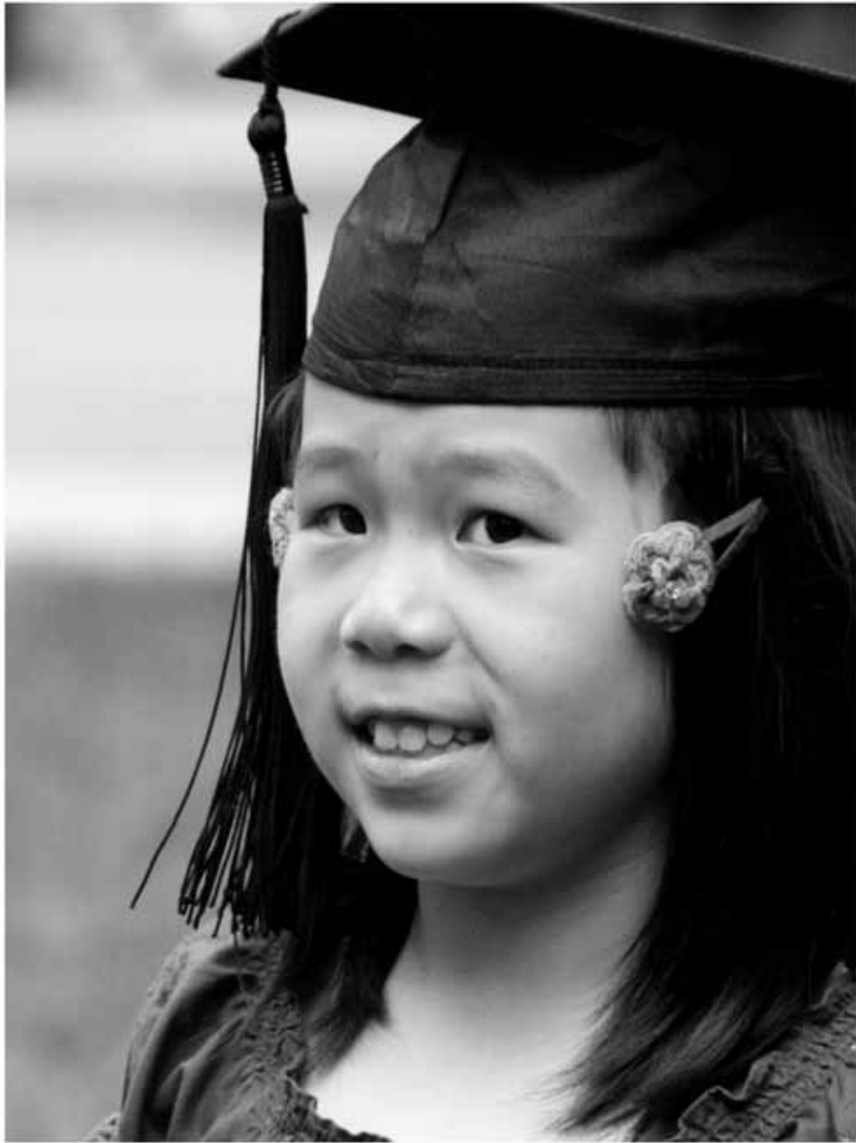
UBC, BC. 2008.