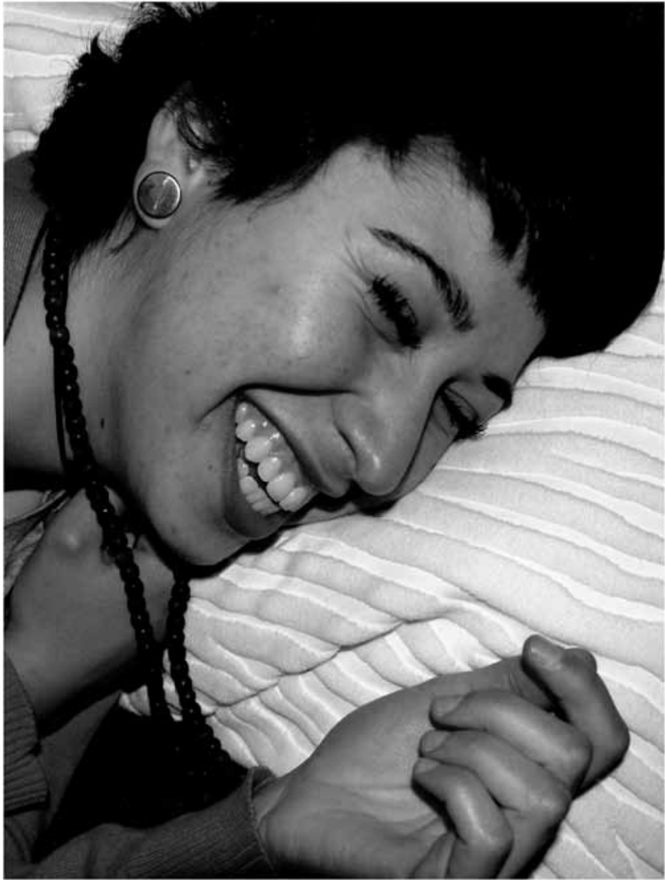
White Rock, BC. 2008.