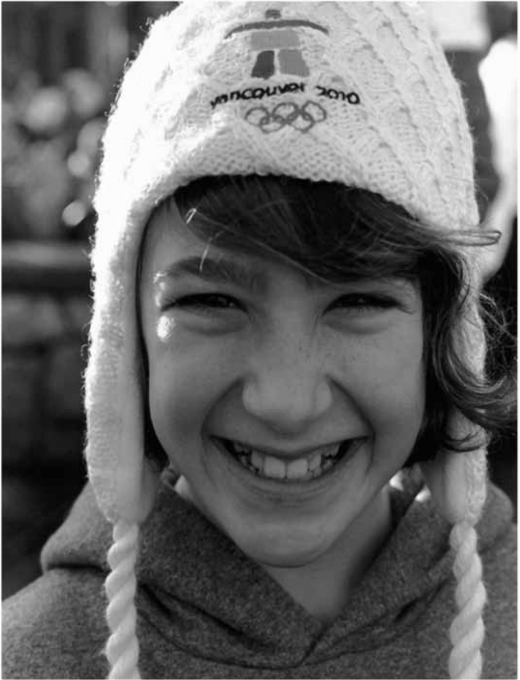
'The Village' Whistler, BC. 2010.