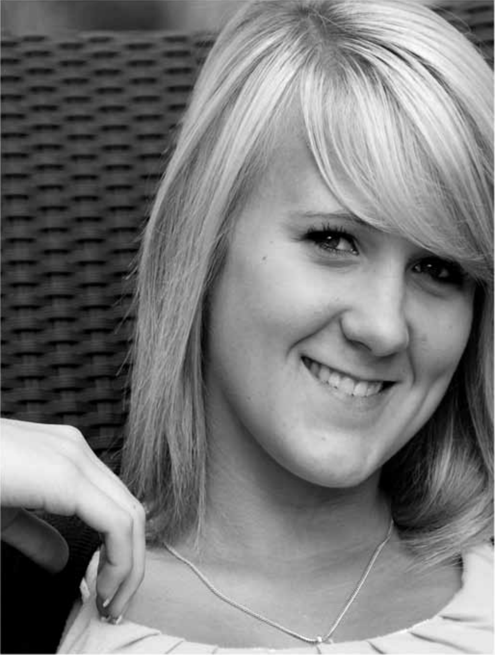
Shuswap, BC. 2009.