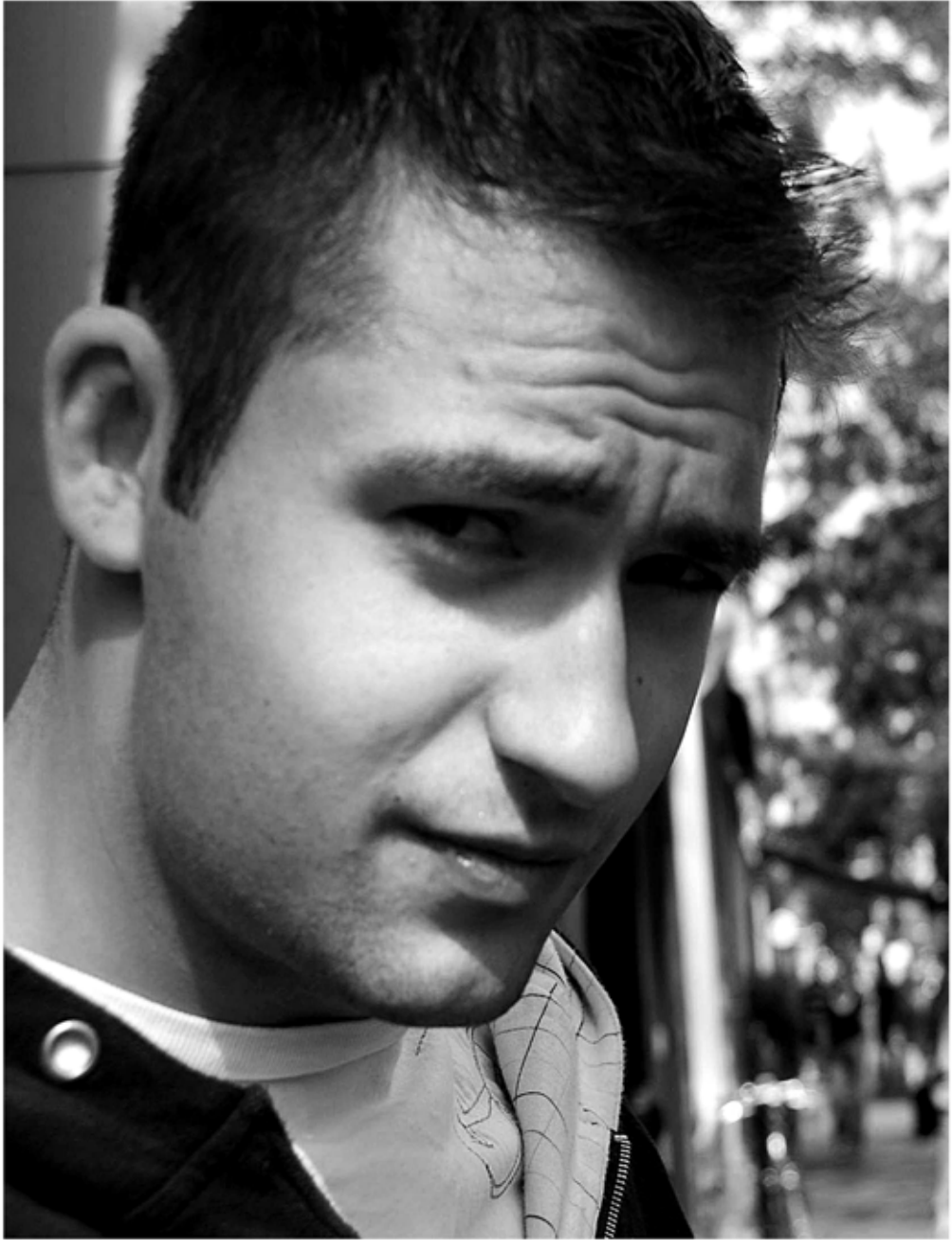
Montreal, Quebec. 2008.