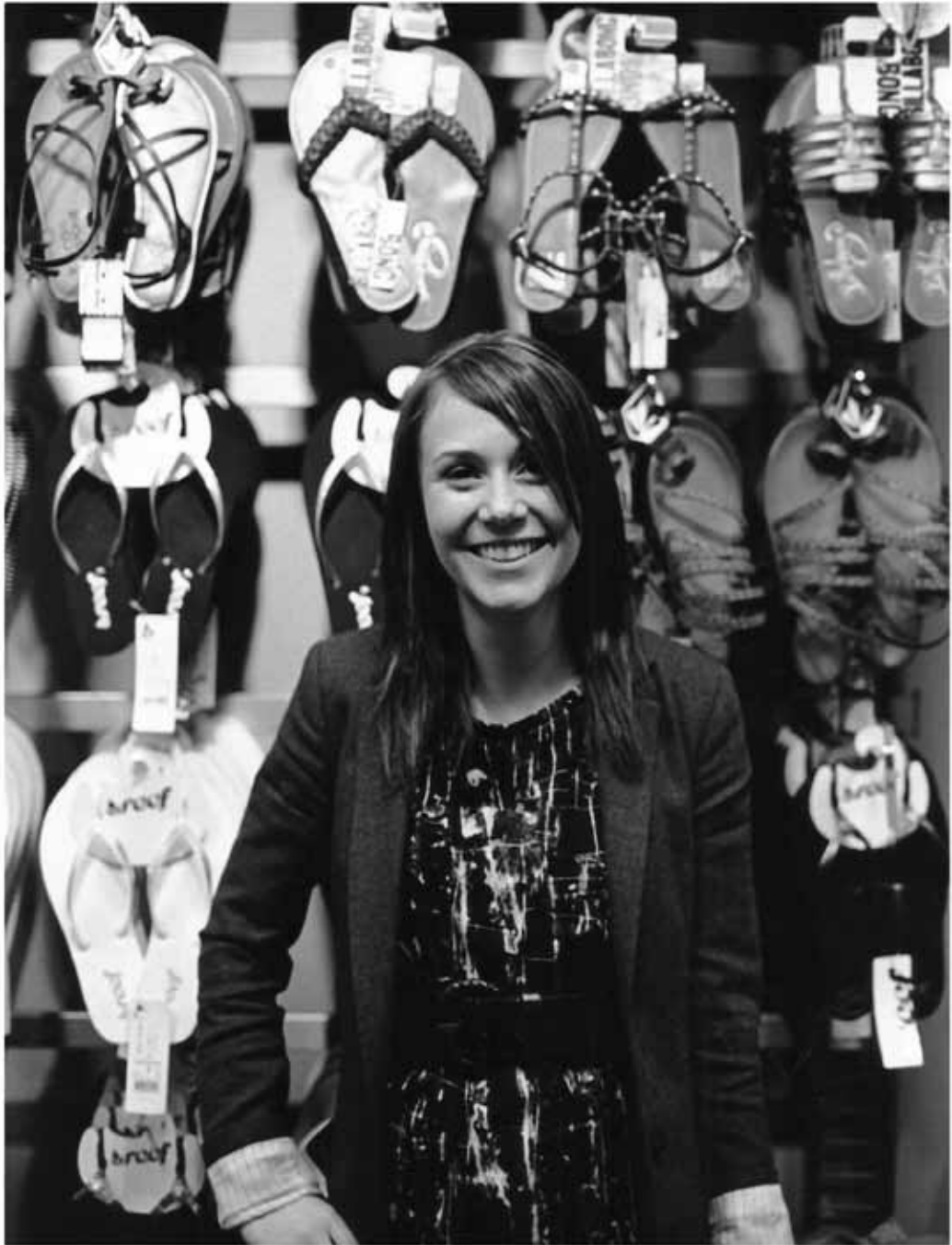
'JJ Whiskey' Ocean Park, BC. 2010.