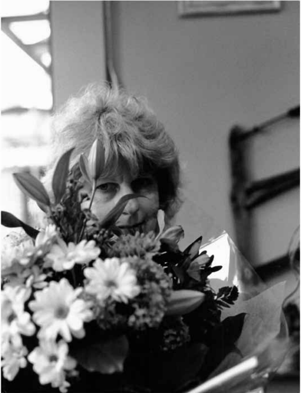
'Ocean Park Flowers' Ocean Park, BC. 2010.