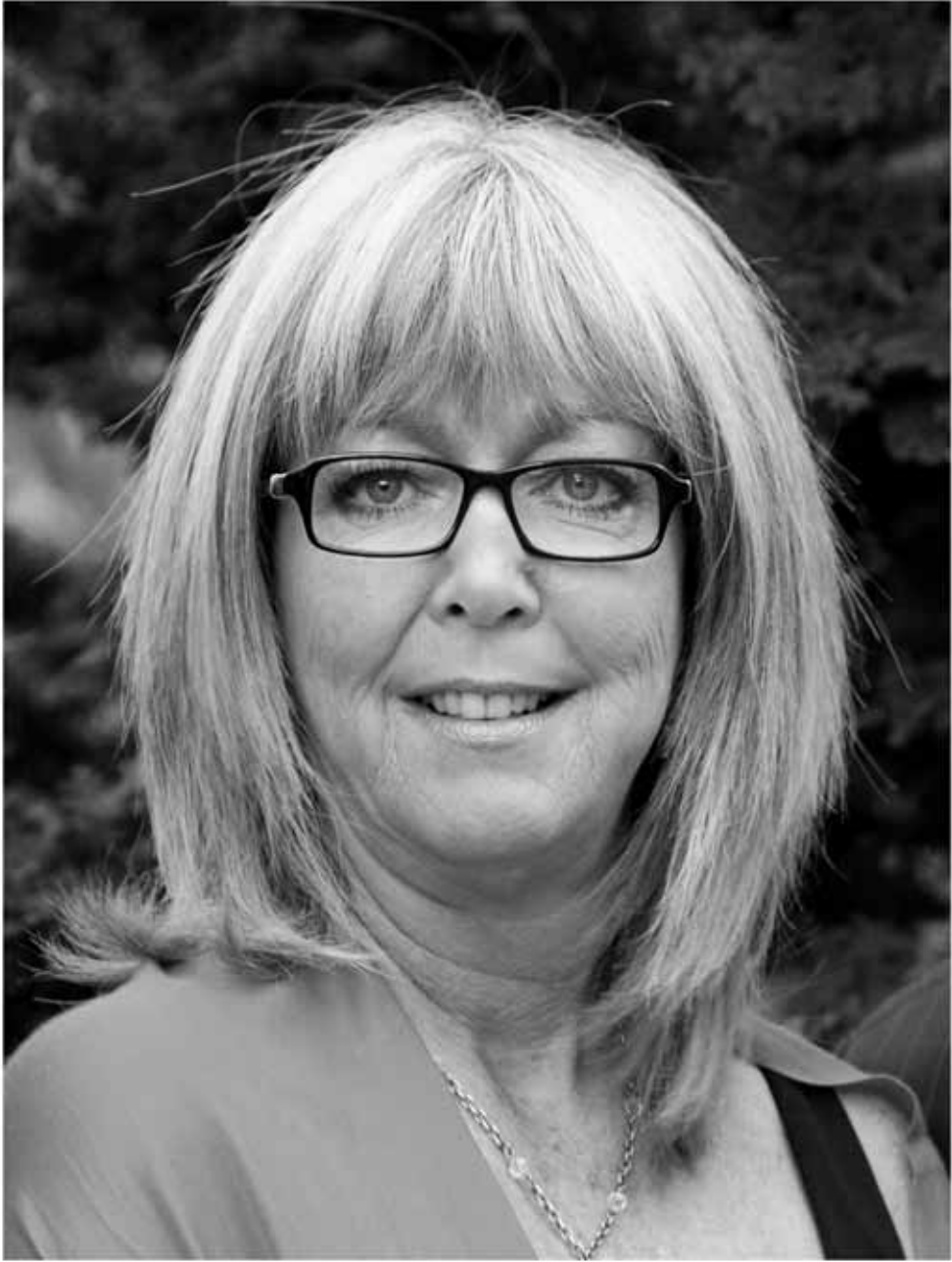
Crescent Beach, BC. 2009.